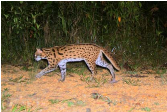
Camera-trapping photograph of a leopard cat. This species is the most common cat species on Borneo and we regularly photograph this species with our cameras and observe it during night surveys.