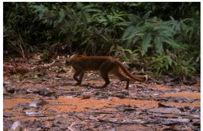
Camera-trapping photograph of a bay cat. This photo is the first confirmed record of this species in Deramakot FR.

The photograph from the bay cat was a surprise for us, as this species have never been recorded for Deramakot before and to our knowledge this is the most northern record of a bay cat. Altogether Deramakot is one of the few areas on Borneo, where we can find all Bornean cat species. However all species except the leopard cat seem to occur in very low densities.