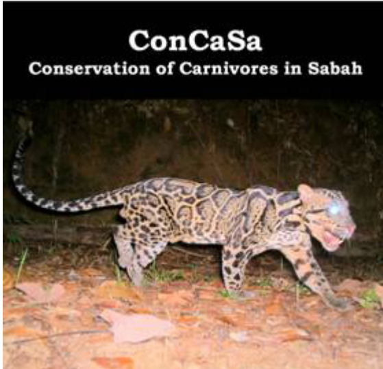
Male clouded leopard photographed in Deramakot Forest Reserve

Many carnivores are under severe threat from permanent loss of suitable habitat. To ensure their long-term protection, an ecologically and economically sustainable large scale habitat management is required. We evaluate the consequences of different forms of forest exploitation for the distribution of felids in Sabah. All results will be used to compile management and conservation plans for these threatened species in close collaboration with local counterparts.