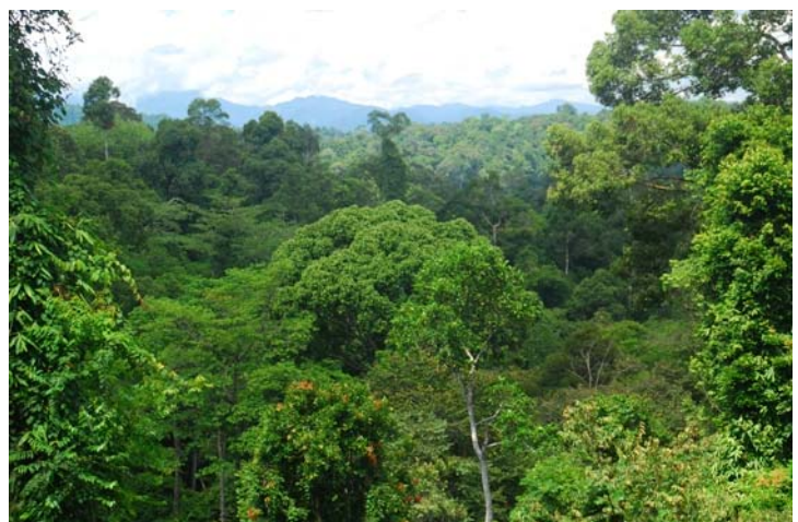
View on Deramakot Forest Reserve.

Within each study site GPS coordinates will be taken and a digital map will be produced using GIS software such as ArcGIS 9.3 (ESRI Inc.). Around each camera-trapping station we describe the habitat characteristic along three 250 m (0°, 120°, 240°) line transects. Along these transects we measure different vegetation parameters: (1) the canopy height with a rangefinder, (2) the diameter breast height (DBH) of all trees above 10 cm of diameter in a distance of 2 m from the transect, (3) the canopy cover using a spherical densitometer, and (4) the understory vegetation density using a vegetation density board. Furthermore we record signs of disturbance like cutting signs or former logging roads, water resources as streams or water ponds, fruiting trees and pioneer as well as climax trees. As our camera-stations are evenly distributed we expect to get a very good overview about the habitat throughout our study sites.