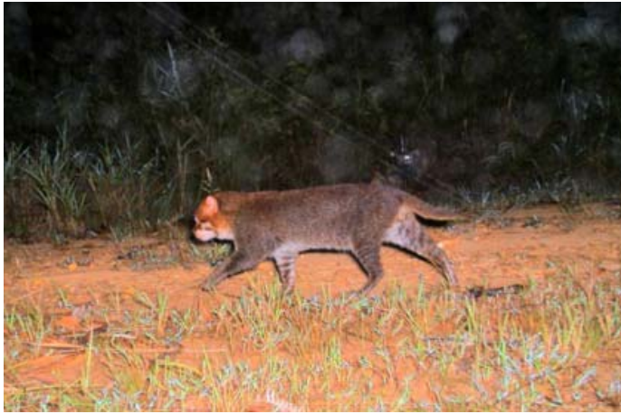
Camera-trapping photograph of a flat-headed cat. Like the bay cat confirmed records of this species are very rare and since 2008 it is one of the few cat species classified as endangered on the IUCN red list.

It is also remarkable that all our records of the flat-headed cat were from the north-western part of Deramakot which is flatter, with more water ponds, lakes and streams. The detailed analysis of the vegetation surveys together with the camera-trapping data will hopefully provide us with further information about the important habitat characteristics for this and the other cat species.