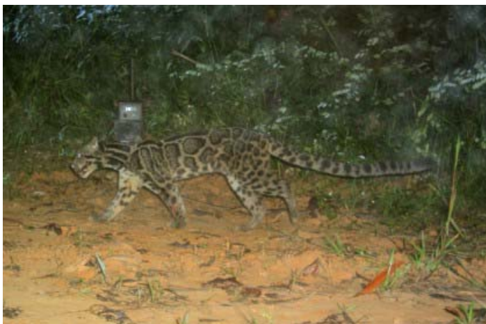
Camera-trapping photograph of a female clouded leopard from our second study site Tangkulap Forest Reserve.

The continued depletion of tropical rainforests and the fragmentation of natural habitats have created substantial ecological changes which lead to a significant challenge for most carnivores. Due to their spatial requirements, carnivores are among the first to suffer when their pristine habitats are changed through human exploitation. On Borneo, in particular, the conversion of previously forested areas to primarily oil palm plantations puts substantial pressure on this biodiversity hotspot. Currently there is no information on the population status, or the effects of habitat fragmentation on any 5 Bornean cat species (Sundaland or Sunda clouded leopard Neofelis diardi , bay cat Pardofelis badia , marbled cat Pardofelis marmorata , flat-headed cat Prionailurus planiceps and leopard cat Prionailurus bengalensis ) in Sabah, and basic information on their life histories and population ecology is still lacking. Almost all species have drawn very little attention in the recent past although 4 of the 5 investigated species are classified either as endangered (flat-headed cat and the Bornean endemic bay cat) or as vulnerable (Sundaland clouded leopard and marbled cat) in the IUCN red list 2008. Just one of the five cat species, the leopard cat, is classified as least concern on the red list and this species is also the only one which has been captured and radiocollared so far (Rajaratnam et al. 2007).