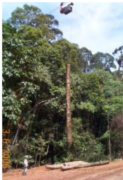
In Deramakot Forest Reserve Reduced Impact logging (RIL) methods like skyline logging are applied to reduce forest damages.

The strong local involvement of counterparts and stakeholders will provide an excellent opportunity to develop recommendations that are practical, relevant and likely to be received positively by those who could implement them.