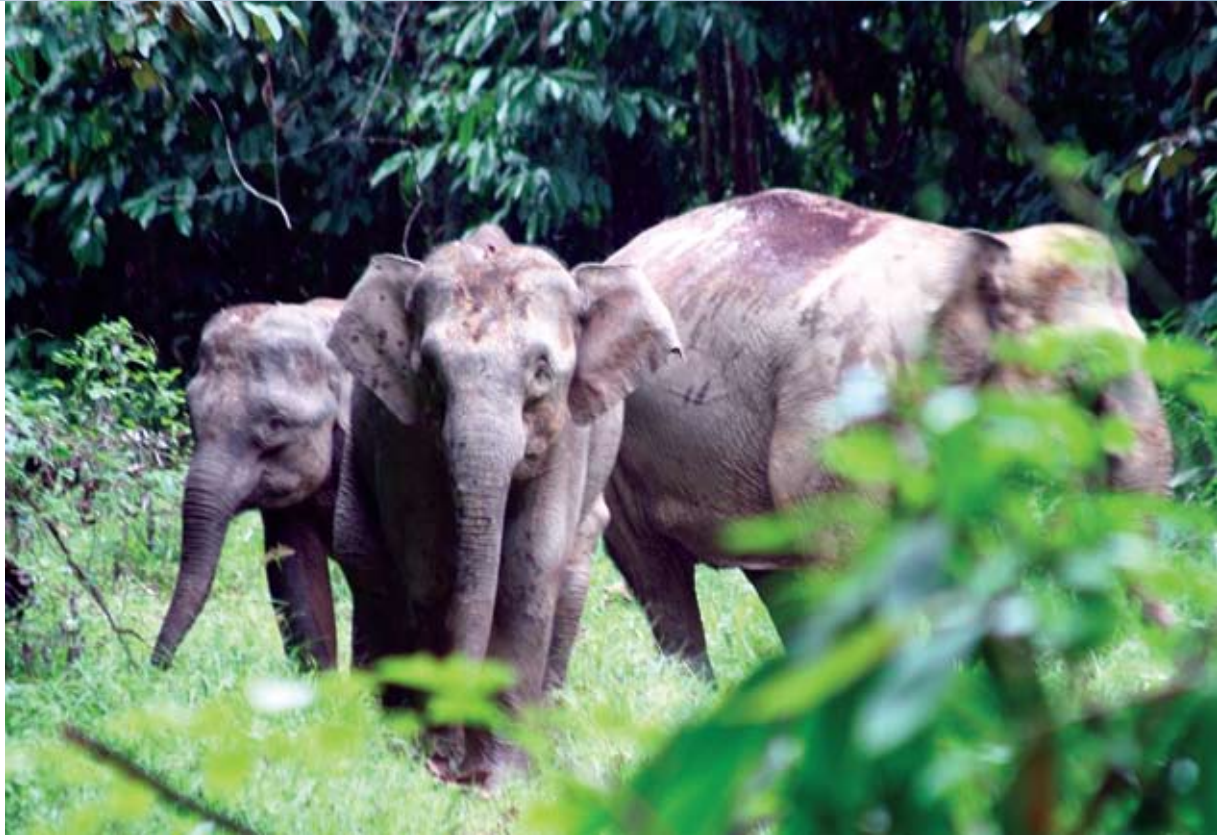
Reduced impact: Wild elephants roam around Deramakot.

<sup>2</sup>Center for Ecological Research Kyoto University, Otsu, Japan kitayama@ecology.kyoto-u.ac.jp